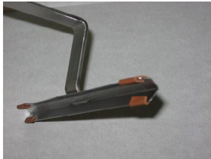
Apply silicon gasket 0.5" from sides