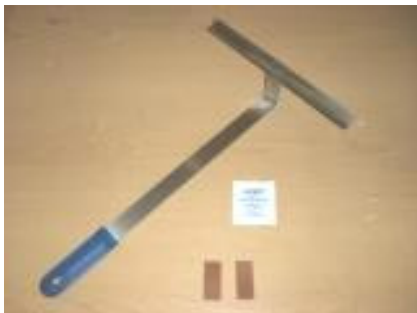
Clean bar holder surface

Clean the surface of the bar holder with degreaser. Attach the silicone gasket to the Teflon tool as in the picture below, 0.5" from the side.