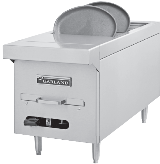
Model FPH12 (Shown with fajita pans supplied by food service dealers)