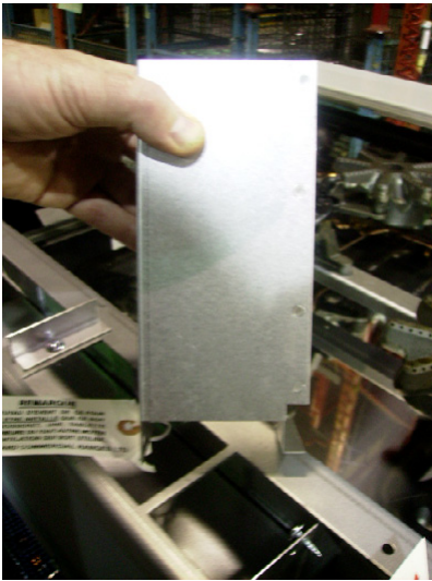
c. The flu should have shipped in the oven