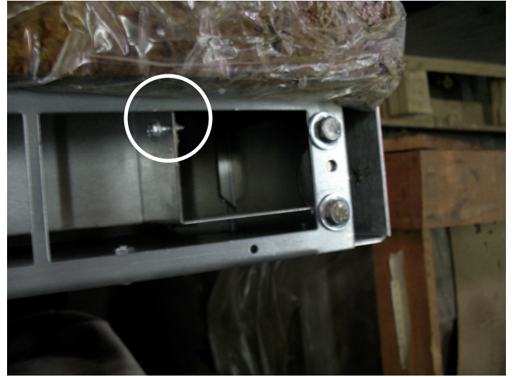
b. Remove Tag and Screw