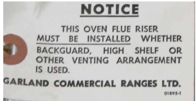
d. Remove the Tag and cable tie prior to installation