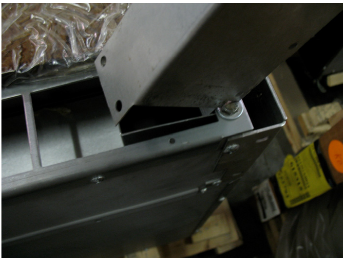
e. Insert the tab end first