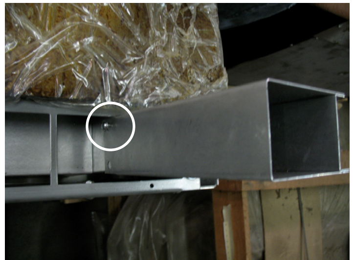
f. Then lower the straight end and install screw.

The Back guard, Riser or High Shelf is now ready for installation.